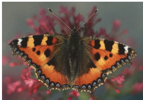
Small tortoiseshell butterfly ( Aglais urticae )