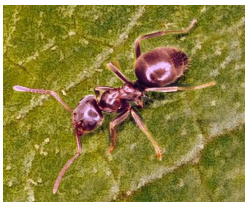
Black ant ( Lasius niger )

The Small tortoiseshell butterfly is widespread in Scotland. It has orange wings with black spots. It is fast flying in bright sunshine but can be seen when feeding on plants such as Buddlia.