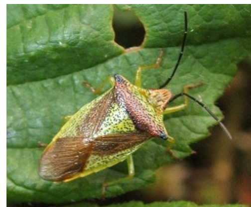
Hawthorn shield bug ( Acanthosoma haemorrhoidale )

This is a very large slug - 10-15cm in length. It is usually black in colour but can also be brick-red, orange or grey! When disturbed it contracts into a broad humped shape. The fringe of its foot is often striped.