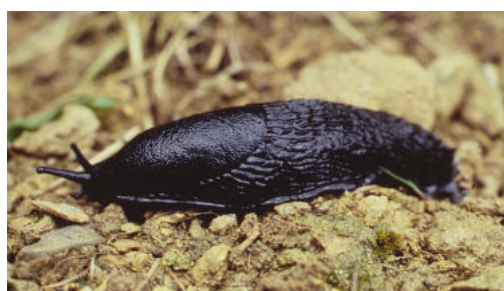
Large black slug ( Arion ater )

Black ants are the ant species that you are most likely to find in gardens and sometimes indoors! On a hot and humid day between June and September male and female Black ants from many nests take to the air to mate—at this time people refer to them as 'flying ants'.